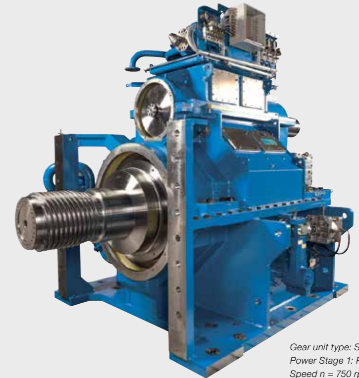
Gear unit type: SVG-2S-1000 Power Stage 1: P = 8,000 kW Speed n = 750 rpm/253.1 rpm Power Stage 2: P = 3,200 kW Speed: n = 750 rpm/193.4 rpm

A characteristic feature of RENK's dredge pump gearboxes is the flexible housing and gear-set designs for horizontal, vertical and diagonal shafts. Single and double input configurations offer optimal flexibility.