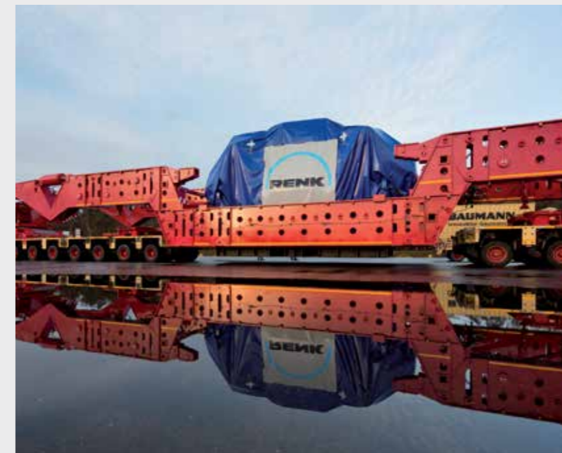
RENK's access to inland waterways and fast connections to major roads provide ideal logistic facilities.