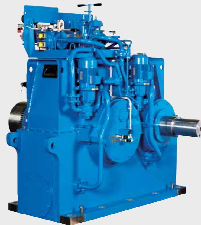
Gear unit type: SH-710 Power: P = 3,800 kW el. motor Speed: n = 1,200 – 1,500 rpm; 280 – 350 rpm