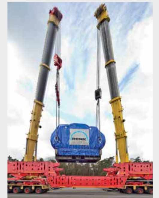
Logistics: 280 ton CDSHII-4800 by waterway and road from Rheine (G) via Rotterdam (NL) to Pula (HR).