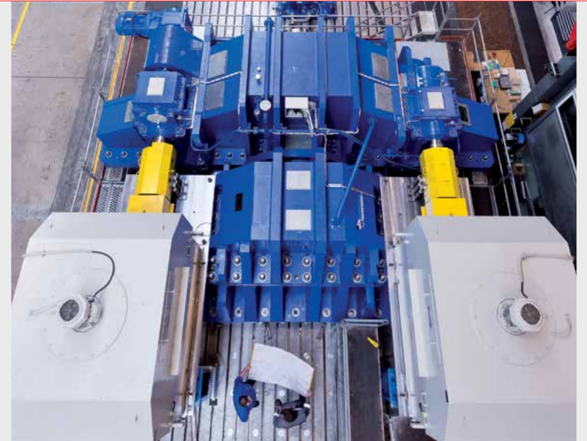
FAT: Full 4 MW load test at factory in Rheine.