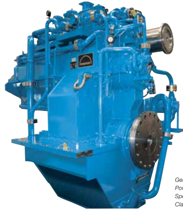
Gear unit type: RSVL-950 Power: 7,200 kW Speed: 500/145.6 rpm Classification: BV

In addition to complying with the chosen classification society requirements, the gear units are engineered to RENK's in-house safety standards which are often even stricter.